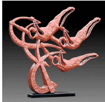
“Spirits of the Chicamocha”