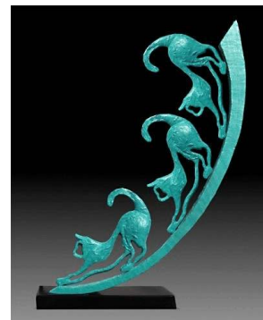
Top: “Reaching El Dorado;” Above: “Three Musketeers”